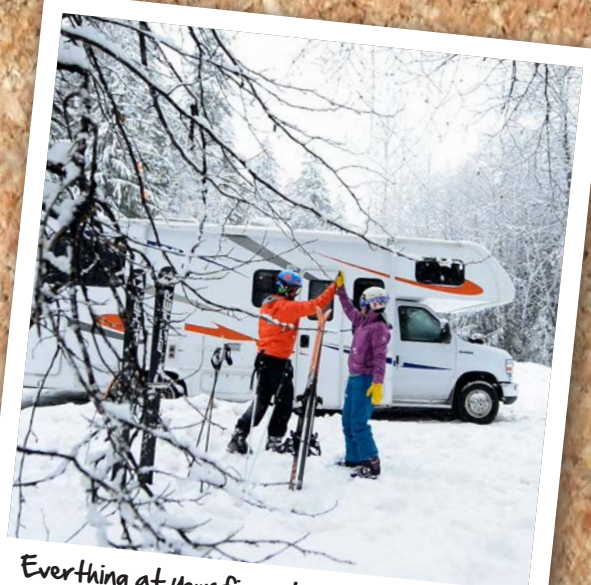
Everything at your fingertips ... and it's right at your doorstep 24/7.