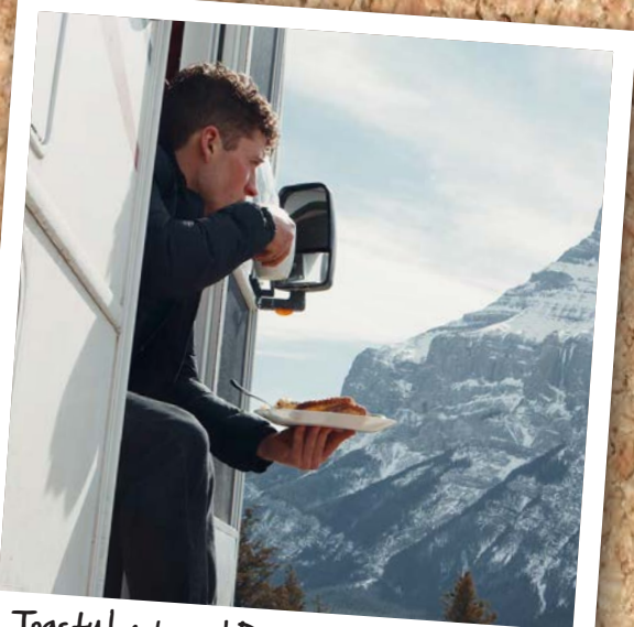
Toasty lunchroom! Prepare and eat your own food wherever you happen to be