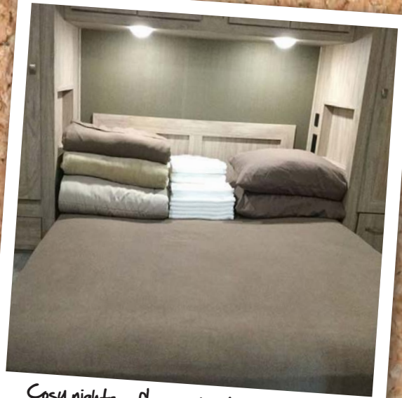
Cosy nights - fleece sheets, heavy duvet and blankets keep you super warm