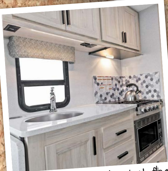
Have your breakfast favourites on hand - flip a pancake, create an omelet or dive into porridge.