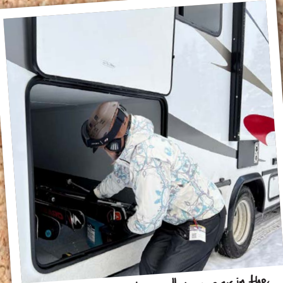
Super storage - keep all your gear in the generous exterior storage compartments