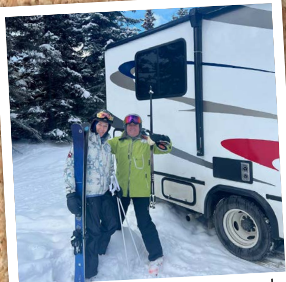
Getting ready to explore was never easier! Boots on and out the door!